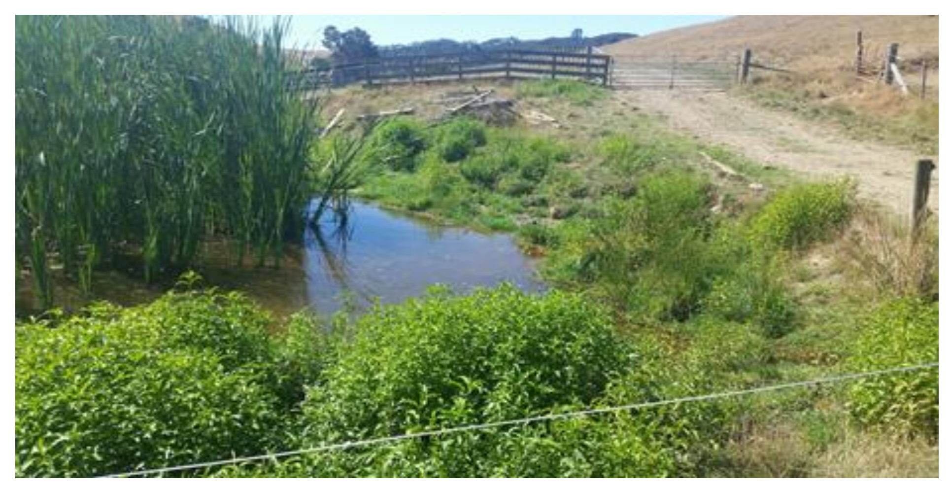
Cost to fix: 100m\ 2 wire permanent electric fencing x $5.47/m, 50m bungy, 4 x bungy gates, 20m underground cable, 1 Pk Woodpost claw insulators Total Cost = $778 (electrified from existing fence)