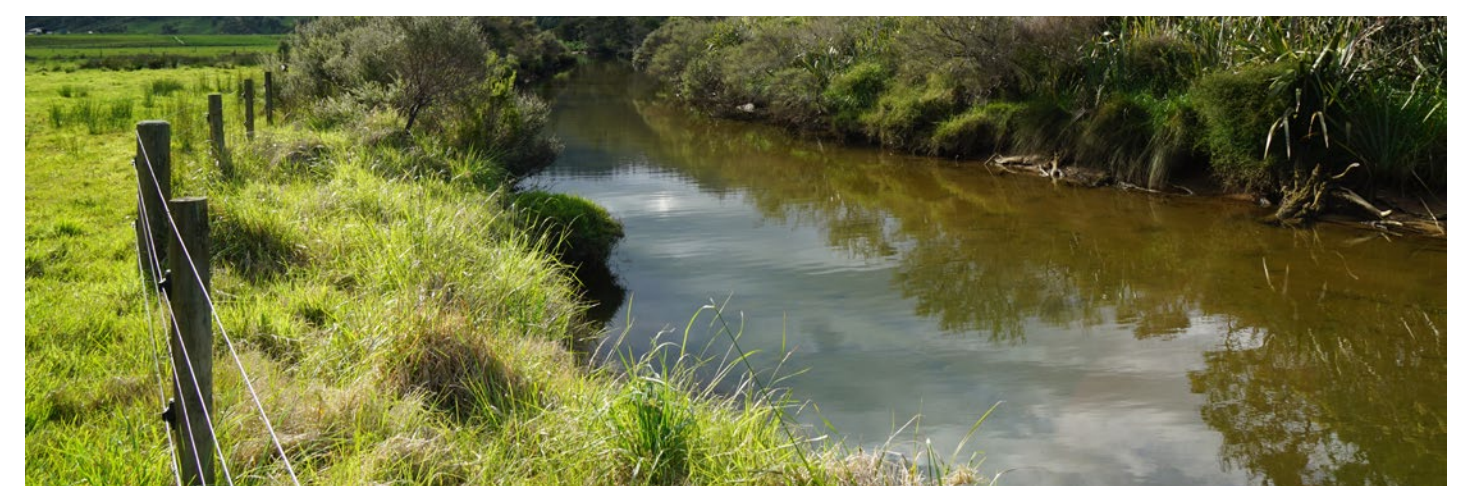
The naturally coloured water of Pepe Stream.

Faecal bacteria typically come from the intestines of warm blooded animals (e.g. cows, sheep and humans). High levels of bacteria indicate an increased risk of getting sick after swimming.