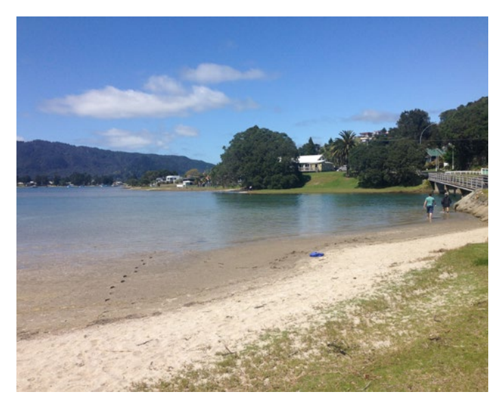
Entrance to Pepe Inlet.