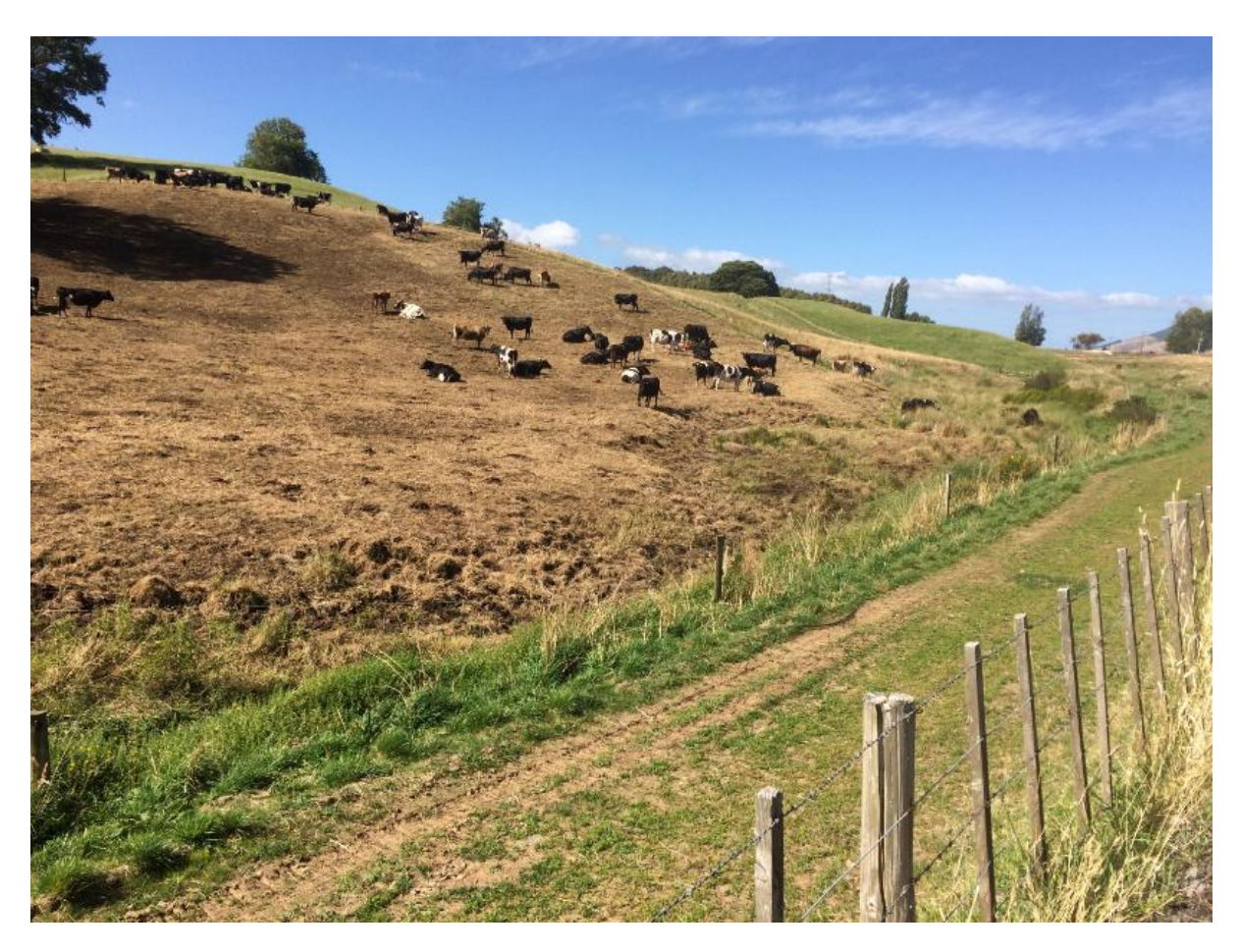
Note that there are animals grazing in the drainage channel, which carries water most of the year.

How will a farm environment plan promote the behaviours of my first example, and prevent the behaviours of my second example? Nothing in Schedule 1 tells me how a FEP will prevent hard grazing.