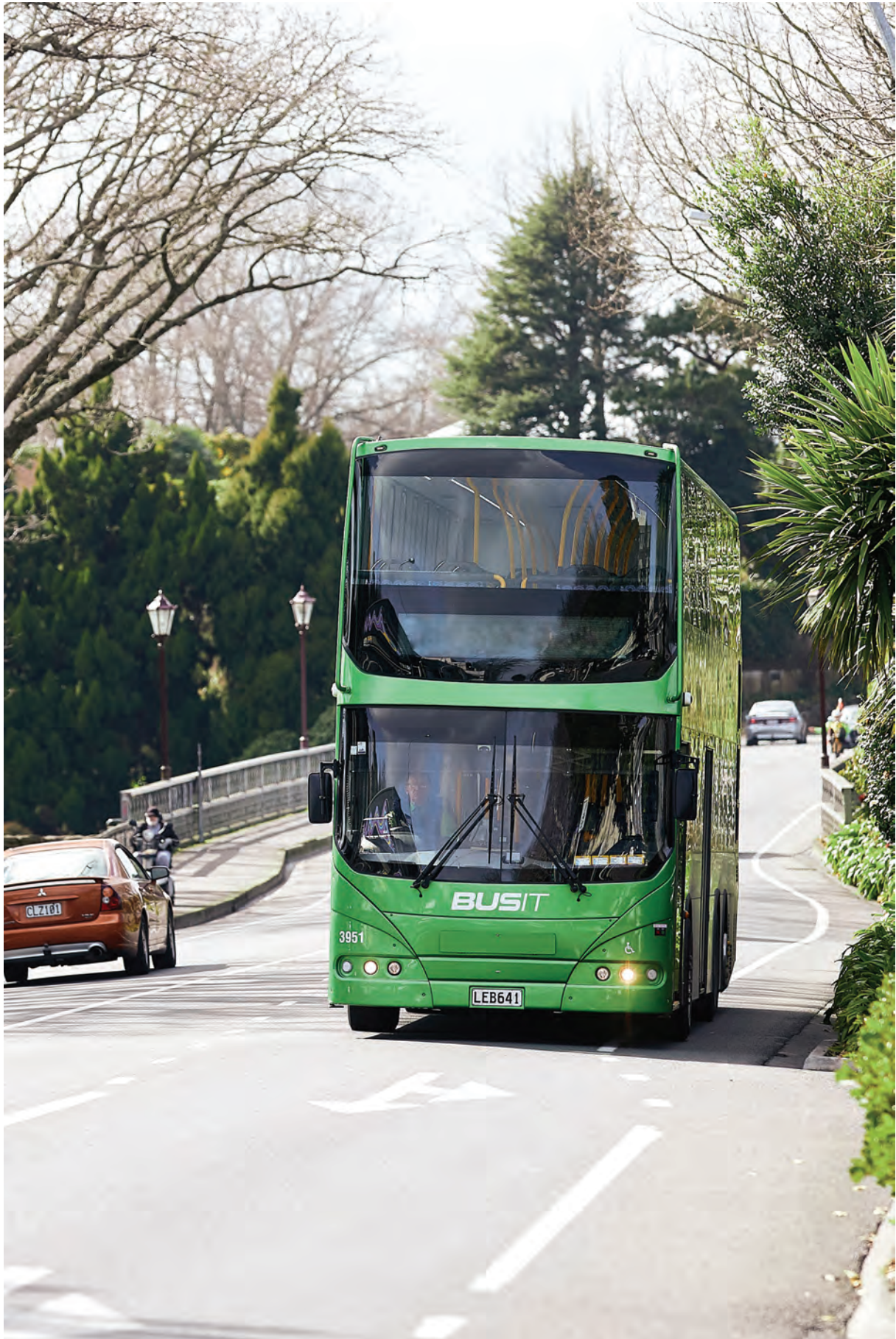
Double decker buses rolled out on Waikato Regional Council's public bus network for the first time in April 2018.